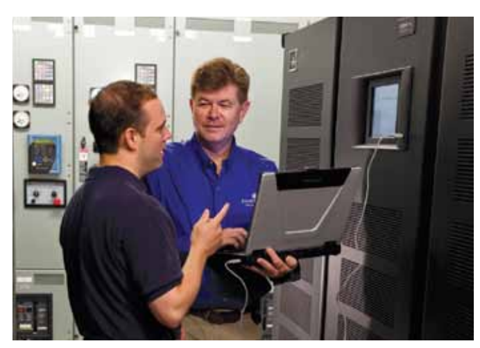
Using sophisticated tools such as Computational Fluid Dynamics (CFD) modeling, Liebert Services will assess your electrical and cooling infrastructure and enable you to make informed decisions on the energy efficiency of your data center.

These days, you not only face increased energy costs — you face them with the pressure to run more environmentally-friendly operations while maintaining 24/7 availability and meeting expanding IT demands. An efficiency assessment from Emerson Network Power, Liebert Services will help you meet this rigorous challenge by identifying energy reduction opportunities without compromising availability.